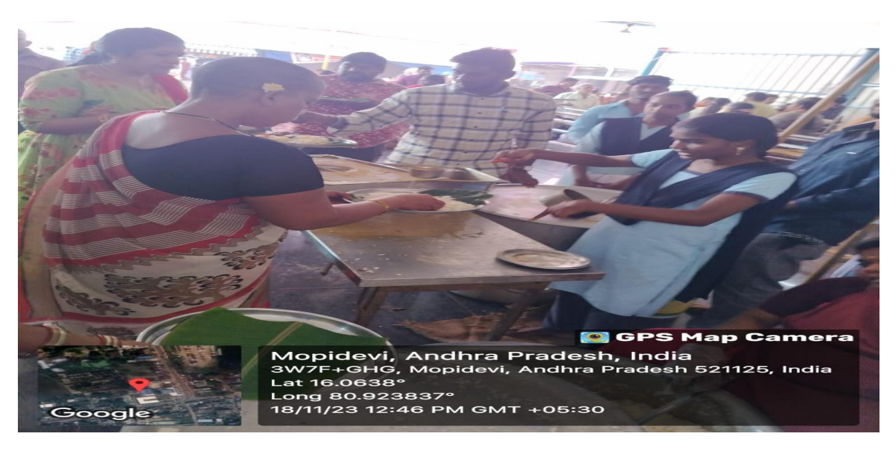
FOOD SUPPLY-NSS VOLUNTEERS AT MOPIDEVI