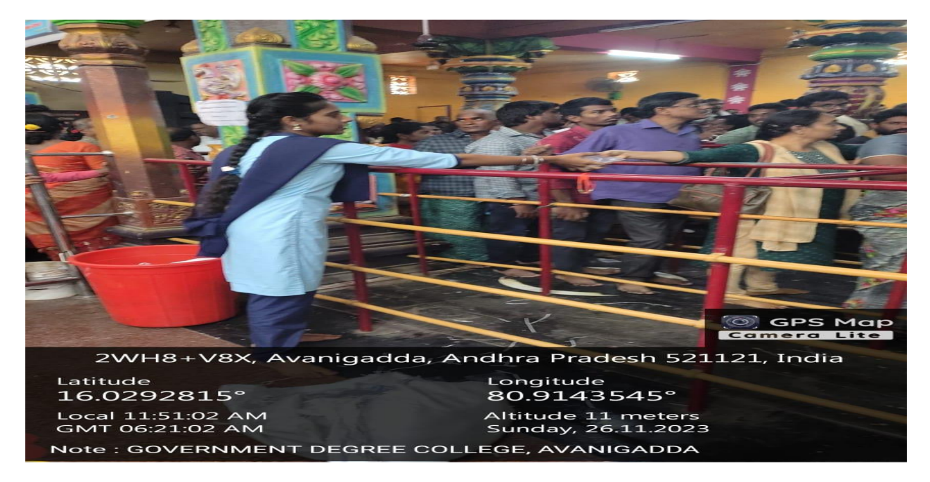
FOOD, WATER SUPPLY--PRASADAM PACKING